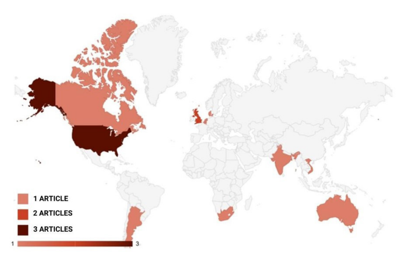
Figure 2. Map of distribution by country and publication of the papers selected

In addition to accessing education resources, many children who attended school depended on it for healthy food, since food at school is one of the main nutrition sources for children at poverty situation. The suspension of classes has interrupted these children's access to quality food, which may have significantly affected their cognitive development, especially for the younger ones<sup>(19)</sup>, since the meals offered by the school are positively associated with good academic performance<sup>(23)</sup>.